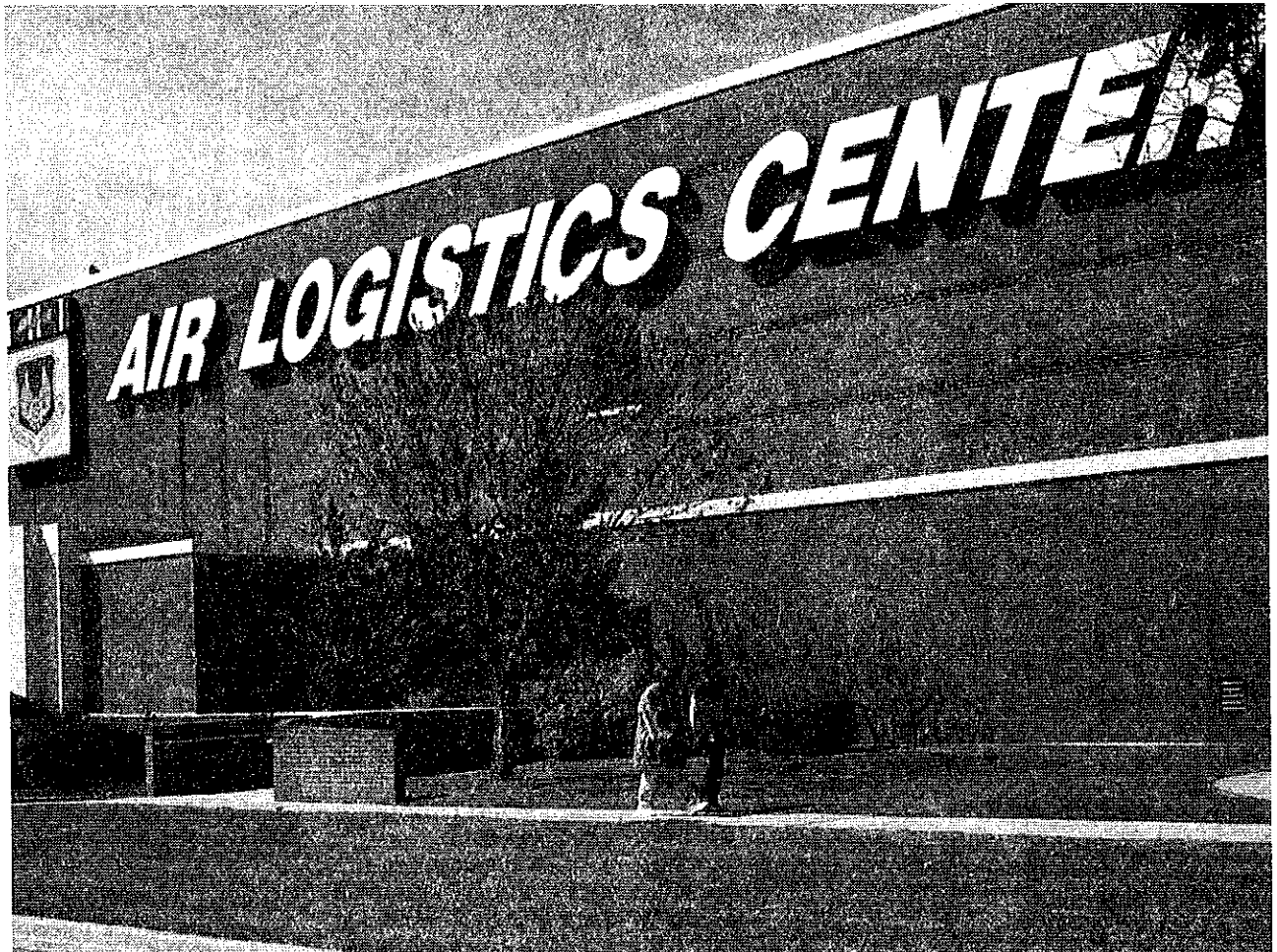
The Oklahoma City Air Logistics Center is part of Tinker Air Force Base. Because of a spending bill signed by President Bush, the base will get two aircraft hangars and a new medical clinic.