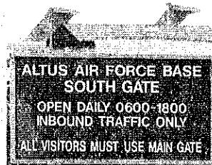
Altus Air Force Base